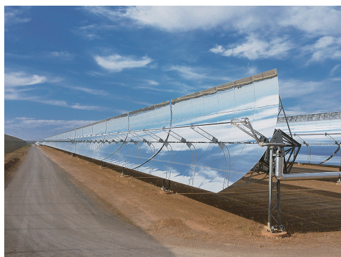
Film mirrors for concentrating solar power generation

As part of its SDGs (Sustainable Development Goals) initiatives in the area of intellectual property, Konica Minolta participates as a partner company in “WIPO GREEN” *7 (operated by the World Intellectual Property Organization (WIPO) of the United Nations), an international platform for technology exchange that aims to achieve a sustainable society. Konica Minolta has registered two patent portfolio with WIPO GREEN, one related to film mirrors for concentrating solar power generation and another related to dye-sensitized solar cells that can generate power even under low illumination. By releasing patent rights, which are generally considered to be exclusive rights, in specific areas, we seek to contribute to the achievement of SDGs with our internally developed environment-related technologies while exploring optimal use of our intellectual property in the new era.