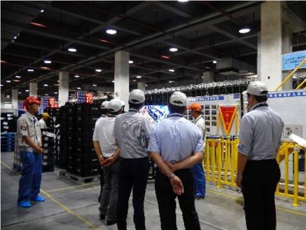
BMWX invites external stakeholders to its factory to share eco-friendly practices.

Under its Eco Vision 2050, Konica Minolta has been promoting the Carbon Minus concept, involving external stakeholders in its environmental efforts to reduce CO 2 emissions by more than is emitted from its products throughout their lifecycles. BMDG, in addition to encouraging eco-friendly practices in-house, endeavors to share its environmental improvement measures with suppliers and customers through factory tours and environmental seminars, while visiting the factories of its suppliers to discuss measures to reduce environmental burdens together and help them implement the measures. In doing so, BMWX contributes to reducing CO 2 emissions both internally and externally.