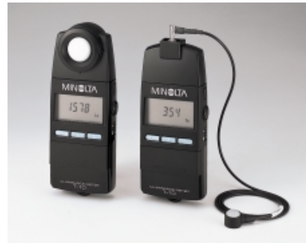
The compact, lightweight, and easy-to-use products in the T-10 series of illuminance meters are multifunctional and highly precise and use several measurement points.