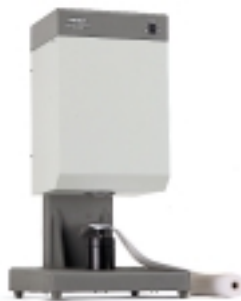
The highly precise and rapid CM-3630 is a product within the CM series of spectrophotometers that is specialized for use with paper.