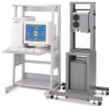
On CRT manufacturing lines, the IA-1000 image analyzer precisely and rapidly performs measurements related to CRT misconvergence and geometry.

Minolta is expanding its business and broadening its product lines in the 3-D field by striving to commercialize next-generation, ultrahigh-precision models that are relatively inexpensive.