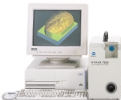
The VIVID 700 is a noncontact 3-D shape digitizer that is portable and easy to operate.

Minolta is creating combinations of hardware and software technologies that make 3-D information easy to capture, process, edit, display, and output. In 1997, Minolta began marketing its VIVID 700 noncontact 3-D shape inputting device and announced the development of the High-Speed 3-D Digitizer Modeling System, which uses 3-D data from the VIVID 700 to quickly create wooden or metal prototypes as well as statues. In May 1999, the Company announced its development of the MINOLTA 3D 1500 portable and integrated 3-D image capturing and editing system, which handles 3-D image inputting, editing, production, and outputting and is particularly appropriate for creating Internet home page contents.