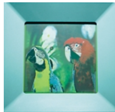
Having developed reflective color display elements that retain images without power input, Minolta is working to create such reusable digital media as the chiral nematic full-color LCD.