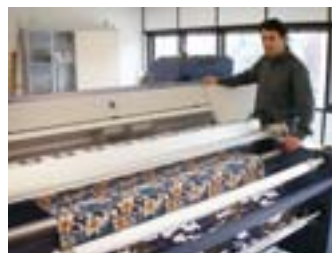
The digital ink jet textile printer system Nassenger V