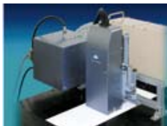
A high-resolution monochrome inkjet print unit SP-M0320HR

Net sales for the Industrial Inkjet business increased 15.4%, to ¥6.9 billion, although operating income fell 31.8%, to ¥0.9 billion.