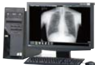
All-in-one console/viewer/ filing system REGIUS Unitea (Outside Japan: ImagePilot )