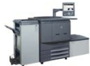
On-demand printing system Pagemaster Pro 6500 (Outside Japan: LD-6500 )