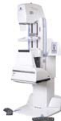
Mammography system REGIUS PureView Type-M