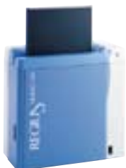
X-ray image reader REGIUS MODEL 110

We intend to focus our business on digital equipment and solutions as the market shifts from films. We will further expand sales of digital equipment, particularly the REGIUS MODEL 110 and REGIUS Unitea ( ImagePilot outside Japan).