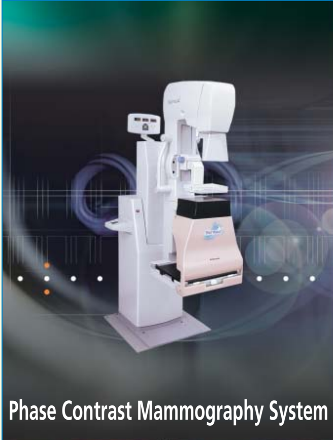
Phase Contrast Mammography System

Note: The product image shown is a Japan model. Appearance and product specifications may vary for other regions.