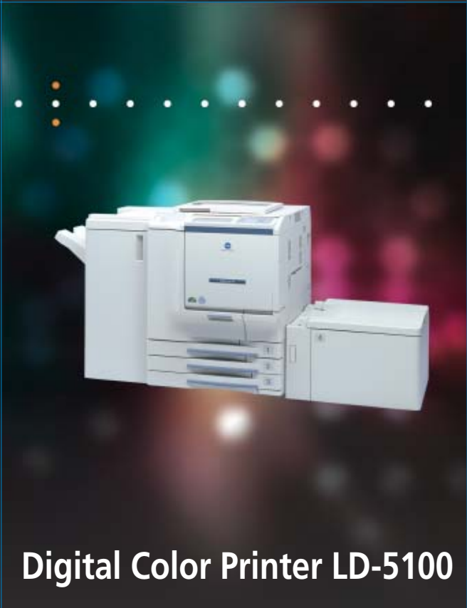
Digital Color Printer LD-5100

The report integration-type picture archiving communication system (PACS) and radiology information system (RIS) realize the integration of image information and medical charts.