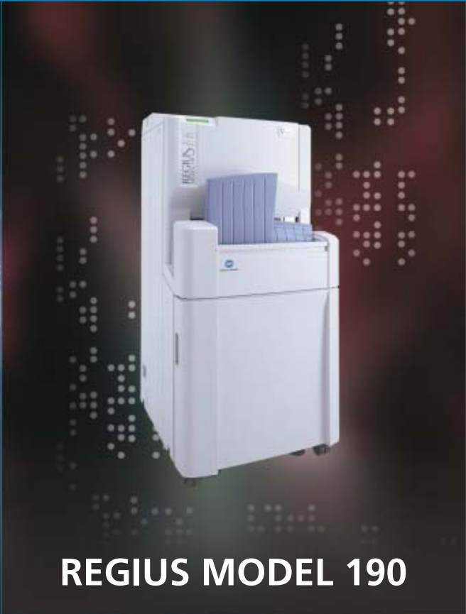
REGIUS MODEL 190

A cassette-type direct digitizer with superior imaging characteristics for the digitization of X-ray images