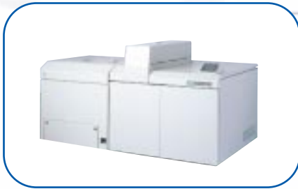
Konica Digital Konsensus

proofing, with the Konica Konsensus series of analog systems and Konica Digital Konsensus winning market praise for their high productivity and cost efficiency.