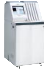
Konica Direct Digitizer REGIUS Model 150

Konica released the Konica DRY PRO 722, a high-performance, high-volume dry laser imager that uses ecologically sound dry silver-halide film technology. The Konica Direct Digitizer REGIUS Model 150 was also launched during the fiscal year. This cassette-type digital imaging system has a compact design and can be integrated with the Konica