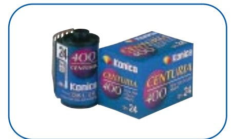
Konica Color CENTURIA series

The Konica Color CENTURIA color print film series, which was released worldwide under a unified packaging scheme in January 1999, sold well in all markets. Also, Konica has extended the CENTURIA series to include films for the Advanced Photo System (APS). The Konica Color CENTURIA APS series incorporates the latest advances from Konica in color negative film manufac-