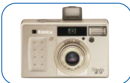
Konica Revio Z3

Sales of compact cameras increased during the fiscal year, with APS cameras being the main contributors to sales growth. The popular Konica