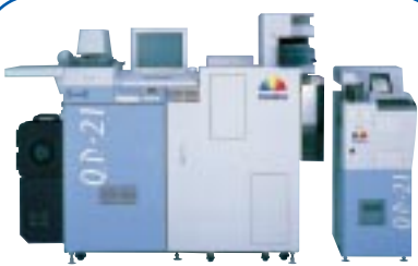
Konica Digital Minilab QD-21 Plus System

Sales of photographic film and paper in the United States increased 22% during fiscal 2000, and Konica Photo Imaging, Inc., returned to profitability. Sales in Europe and Asia were also brisk, with concentrated marketing campaigns in Russia and selected Asian countries leading to significant increases in sales. However, depressed domestic demand resulted in a decline in overall photographic materials sales.