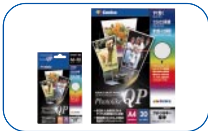
Konica Inkjet Paper Photolike QP

The Konica Inkjet Paper Photolike QP series, a quick-drying photo-quality paper