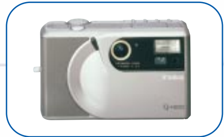
Konica Digital Still Camera Q-M200

Revio series of APS cameras was expanded by the addition of the Konica Revio Z3. Featuring the same sleek design as earlier Konica Revio models, the Konica Revio Z3 includes a 3x zoom lens, a flash management function—which can save up to 50% on battery power—and a unique self-portrait mode, which enables photographers to perfectly frame self-portraits.