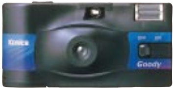
Torikkiri Konica Mini Goody

for film-in camera picture quality, by expanding marketing channels.